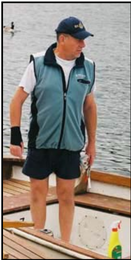
Coxswain keeping an eye on preparations for the Great River Race

Although we are not due an RN Inspection yet, we have a lot of work to do to bring the Troop up to the standard that is expected. Sea Scouts can look very smart when in uniform and personal turnout is good, but they look awfully scruffy when uniform and appearance is sloppy.