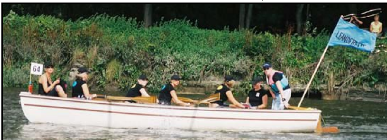
The Leandettes (or is it Leanderettes?) enjoying the Great River Race