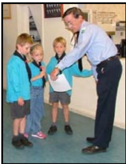
Three new Beavers invested by the Group Scout Leader