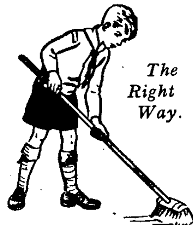
The Right Way.