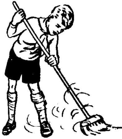
The wrong way.