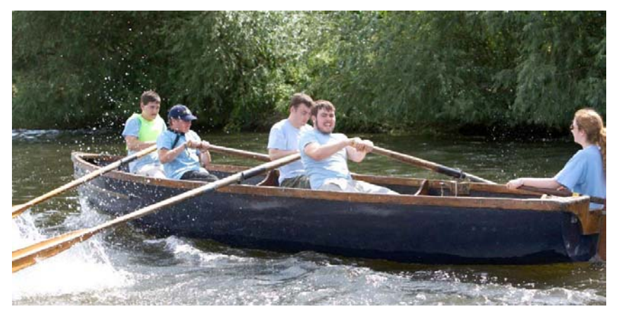
The under-18 gig crew at the Regatta